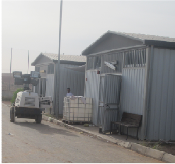
Bou Rashada detention centre. May 2012.

A rubbish collector from Mali, who had lived in Libya for three years, was stopped along with 10 other Malians and four Nigerians from their home in Ain Zara, Tripoli, in late March. He said that they were taken by a group of six or seven men in military dress, put in 4x4 vehicles and driven about 100km to an armed militia base near Gharyan, where other Libyans and non-Libyans were detained. He said: