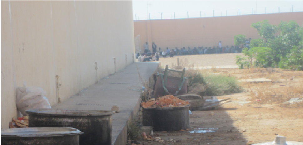
Foreign nationals detained in Ganfouda, who include Somalis and Eritreans. They have no possibility to apply for asylum or challenge the legality of their detention. May 2012

Detention centre officials acknowledge that nationals of Somalia and Eritrea cannot be sent back to their home countries. There is nonetheless no standard approach to address the situation of such individuals in need of international protection.