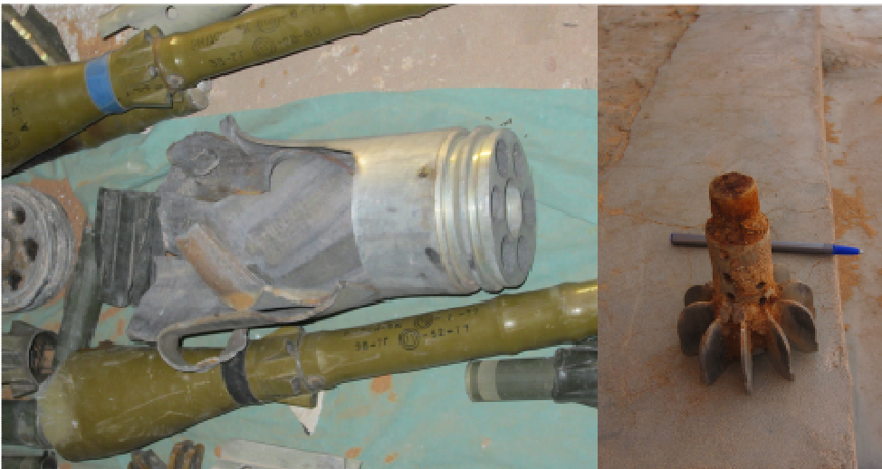
Remnants of weapons found by Amnesty International following clashes in the cities of Sabha and Kufra. May 2012.

Despite releases and the referral of some suspects to relevant civilian or military prosecution offices, progress in charging detainees with recognizably criminal offences has been extremely slow. Some detainees have been held without charge for a year. With rare exceptions, detainees have no access to lawyers and are interrogated alone, despite guarantees stipulated in the Libyan Code of Criminal Procedure. 6 The Minister of Justice told Amnesty International that by June 2012, 164 people had been convicted in common law cases since the end of the conflict. To Amnesty International's knowledge, by early June, only three trials have begun in civilian courts in relation to crimes committed in the context of the conflict, leaving thousands of people detained without trial.