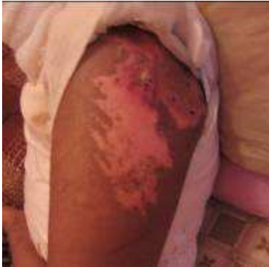
A 27-year-old woman who had boiling water poured on her by armed militiamen in February 2012. Doctor reports say she suffered from 3-4 degree burns. May 2012

Significantly fewer women than men have been arbitrarily arrested and detained in Libya, and those seized have fewer complaints regarding their treatment. Nonetheless, Amnesty International documented several cases of torture or other ill-treatment suffered by women.