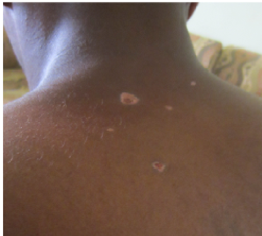
Tabu young man shows Amnesty International marks left by cigarettes burned on the back of his neck in detention. May 2012