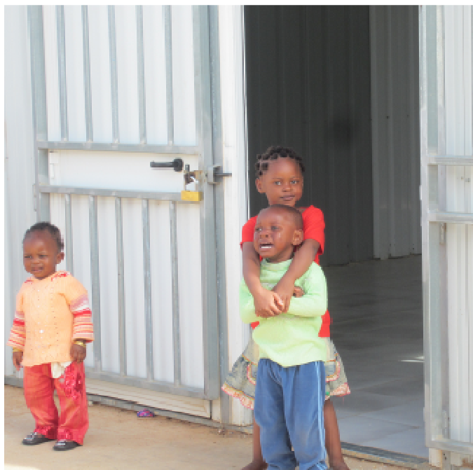
Children at Bou Rashada detention centre for migrants. More than 1,000 men, women and children are detained at Bou Rashada by an armed militia for being “undocumented migrants”. May 2012.

During Colonel al-Gaddafi’s rule, foreign nationals – particularly those from Sub-Saharan Africa – lived with uncertainty and fear of changing policies, arbitrary arrest, indefinite detention, torture and other abuses. After the “17 February Revolution”, their situation was made more difficult by the general climate of lawlessness, the proliferation of arms among the population, and the failure of the authorities to tackle racism and xenophobia, fuelled by the widespread belief of the involvement of “African mercenaries” in the armed forces of the toppled government.