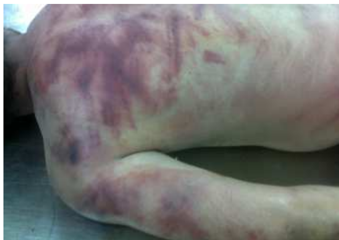
Amnesty International documented more than 20 deaths in custody at the hands of militiamen since September 2011.

Amnesty International gathered detailed information about at least 20 cases of deaths in custody at the hands of armed militias across Libya since September 2011. Medical records and forensic reports, examined by the organization, confirmed that the deaths were the result of abuse – mostly prolonged beatings, leading to internal bleeding and acute renal failure. In at least two cases, detainees died