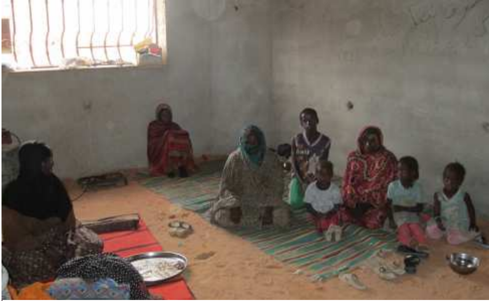
After being forced out of their homes during armed clashes, some 40 Tabus were squatting in a house under construction, with no water or electricity. May 2012.

The woman was squatting in a house under construction, with no running water or electricity, together with five married women, their husbands, and some 30 unmarried young people and children.