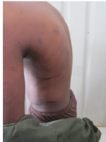
Ghanaian national detained in Libya shows Amnesty International his torture marks. May 2012

along with two other Ghanaians and a Togolese national. They were detained for not having proper papers. The 24-year-old man said he had been beaten severely at the end of March after a failed escape attempt. He said that he was taken into the courtyard and beaten for four hours all over his body, particularly on his arms and back, by a large group of armed men. His scars, visible some two months later, corroborated his account.