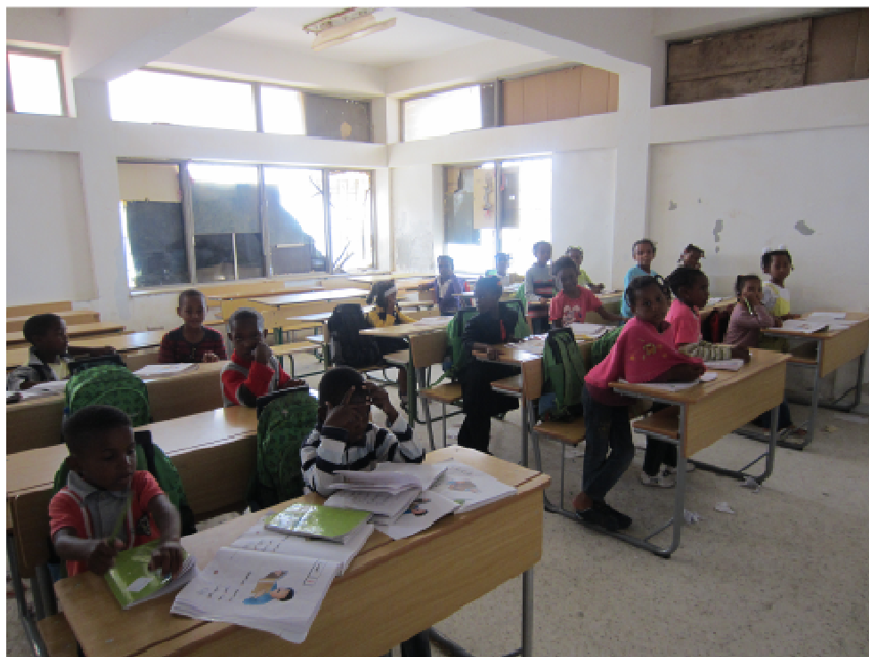
Displaced Tawargha children in poorly resourced classrooms inside the Janzour Naval Academy IDP camp. May 2012.

The authorities have also failed to resolve the situation of entire communities displaced during the conflict and unable to return to their homes, which were looted and burned by armed militias seeking revenge. Entire towns and villages were deliberately rendered uninhabitable by the militias, which accused the displaced communities of supporting the toppled government and of committing crimes on its behalf. The entire population of the city of Tawargha, estimated at 30,000, was driven out by Misratah militias and remains scattered across Libya, including in poorly resourced camps in Tripoli and Benghazi. 7 The Mashashiya community from the areas of Awaniya, Zawayat al-Bajoul and Omer in the Nafousa Mountain faces a similar plight at the hands of Zintan militias. Their suffering intensified following armed assaults on Sgeiga and Mazda in June – home to Mashashiyas – including those who sought shelter after being displaced during the conflict. The violence led to 105 deaths, according to government estimates, and further displacement. 8 Not only are such communities barred from going home; they also continue to face arbitrary arrest and other reprisals.