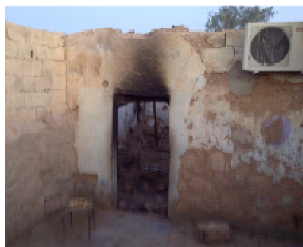
Burned home in Hijara following armed clashes in March. May 2012

Residents told Amnesty International that when they returned after the hostilities, they found their homes damaged and in some cases burned and destroyed. Video footage shows Arab militias entering these neighbourhoods, seemingly after the population left. In at least two instances, they are carrying gas canisters. Amnesty International saw homes in the Hijara and Nasriya areas that appeared to have been deliberately set on fire.