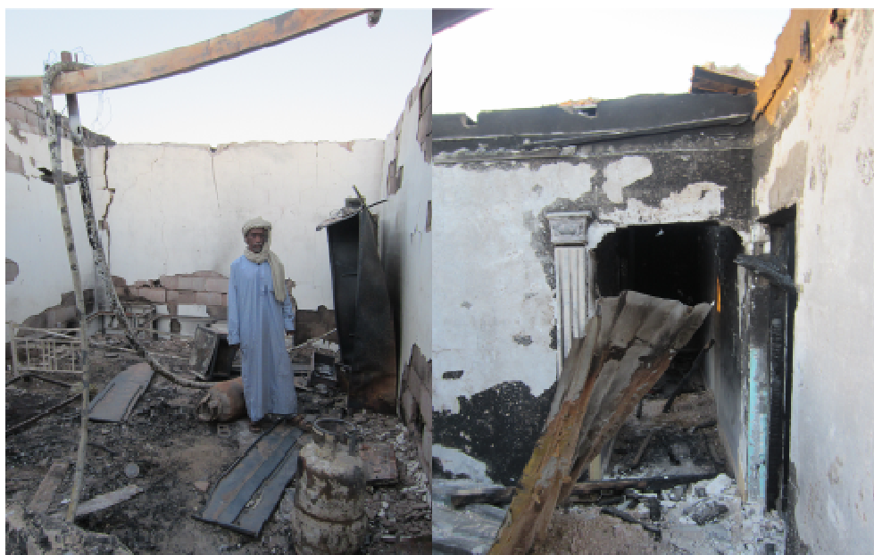
Nasriya residents show Amnesty International their burned and damaged homes, after an assault by Arab militias in March 2012. May 2012

Local residents in Nasriya, a Tabu neighbourhood composed of some 80 families, according to local estimates, told Amnesty International that at about 1.30pm on 27 March, Arab armed militias in tanks and pick-up trucks with machine-guns mounted on top entered their neighbourhood. As the militias advanced, residents escaped and no casualties were reported. When they returned they found their homes and vehicles burned and damaged. Amnesty International assessed the extensive damage and found scores of homes that were charred inside and rendered uninhabitable.