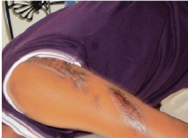
Tawargha man shows Amnesty International his torture marks. May 2012.

Suspects are seized at home by groups of heavily armed men, frequently riding in pick-up trucks with machine-guns mounted at the back. Arrest warrants by the prosecution are never presented, 24 and thuwwar rarely identify themselves or tell distraught families where their relatives are being taken. Amnesty International also documented cases of individuals seized from their workplace and bundled into cars or pick-up trucks, who then disappeared without