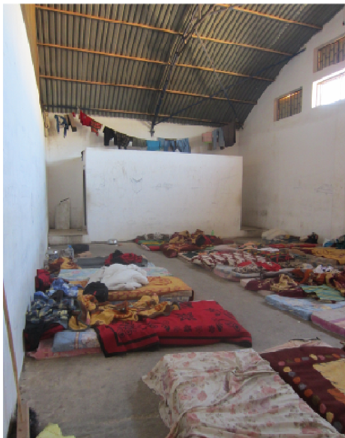
Cell in Ganfouda detention centre. More than 225 people from various countries, including Somalia, Pakistan, Sudan, Chad, Egypt, Eritrea and Ethiopia, were detained in Ganfouda in May 2012.

At the Ganfouda detention centre, a different approach is taken in regards to nationals from Somalia. A member of the armed militia controlling the centre and the director explained to Amnesty International that they search for work opportunities through “Libyan sponsors” for detained foreign nationals. In these work schemes, they prioritize “good Somali Muslims” if they have valid passports, their embassies vouch for them and they have “no contagious diseases”.