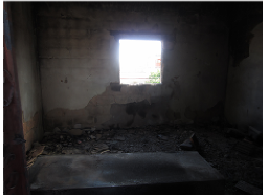
House in Traghan that was burned as a result of attacks by Tabu militias in October 2011. Residents complained that they had yet to be compensated for their losses by the NTC. May 2012