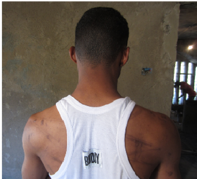
Former detainee shows Amnesty International his scars caused by beatings. He was released without charge after three days in the custody of armed militias. May 2012

"I was first blindfolded. Then, they took me to an office, I think, and made me lie face down."