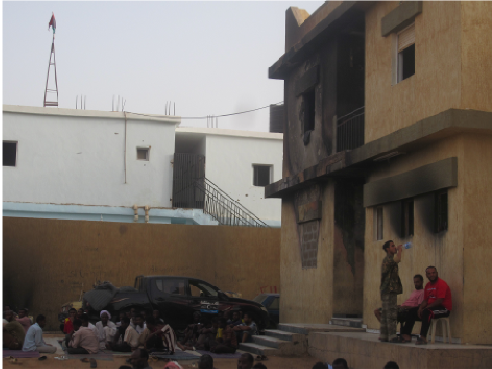
Kufra detention centre. May 2012.

A group of about 20 Somali women, who arrived in Libya after the end of the conflict, told Amnesty International that they were intercepted at sea by two big ships, with Libyans on board, on 29 March. They described embarking at dawn from the coast of Tripoli with some 80 other people of different nationalities, and being intercepted by a Libyan coastguard at about 3pm that day. All of them were immediately taken to a detention centre in Tajoura where they spent a week, before being transferred to the Tweisha detention centre.