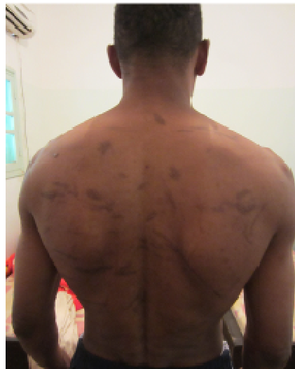
Man from Traghan shows Amnesty International his torture marks. May 2012.

Nine Tabu armed men in military dress captured a