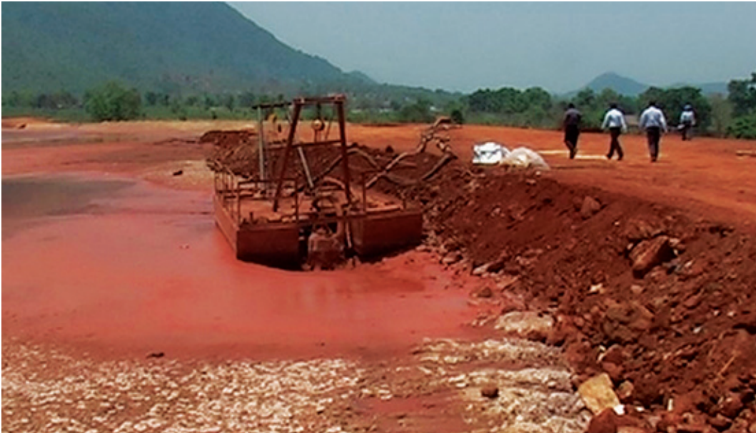
East red mud pond at Lanjigarh, 2011