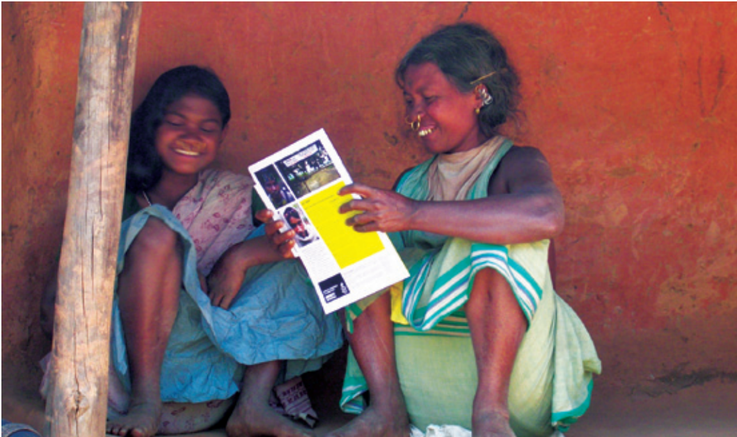
Dongria Kondh women with Amnesty International material

Orissa government nor the companies concerned made any attempt to provide information to them on the details of these plans, let alone consult them or seek their consent. A number of communities living at the top of the Niyamgiri hills informed Amnesty International that most plans continued to be decided not in consultation with or with the consent of the Dongria Kondh communities. They also stated that they continued to have no representation in meetings of elected village council bodies, which the authorities were required to consult with under the terms of the PESA. Also, these meetings were generally on the plains and not in the hills where Dongria Kondh mainly reside.