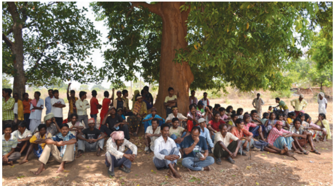
Dongria Kondh protesters at a campaign meeting at Jagannathpur on 9 April 2012