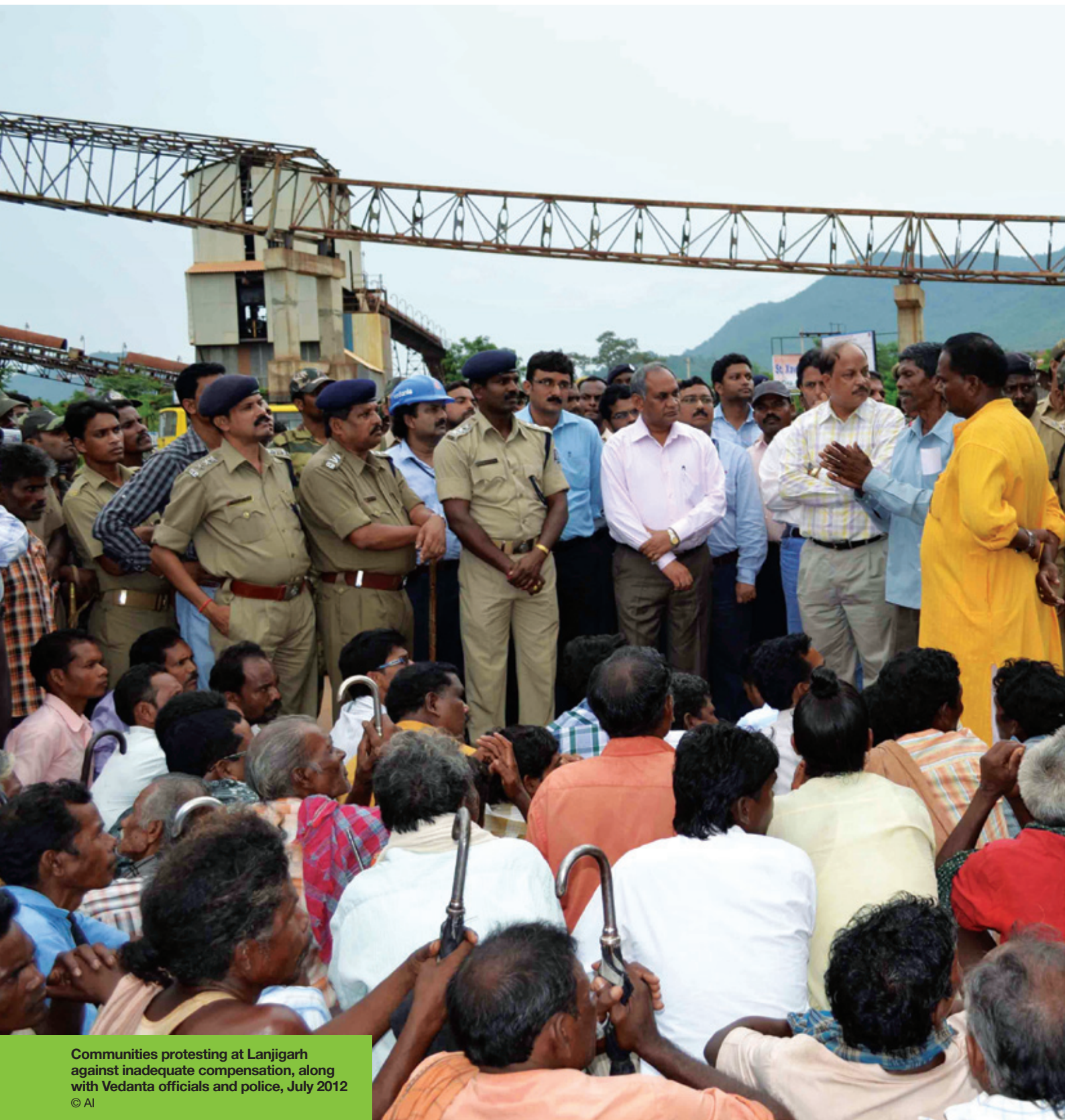
Communities protesting at Lanjigarh against inadequate compensation, along with Vedanta officials and police, July 2012