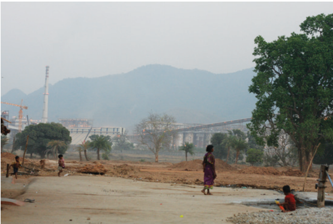
The Lanjigarh refinery, as viewed from Kenduguda village

In September 2010, Vedanta's bank lenders commissioned Scott Wilson Ltd (now URS Scott Wilson) as an independent environment and social consultant with terms of reference to review Vedanta's commitment to sustainable development and assess the social and environmental issues, particularly relating to the refinery and its expansion plans. The lenders required Vedanta to report, every six months, on progress of implementation of these recommendations until the Scott Wilson review determined that this was materially complete and all issues highlighted by it were substantially mitigated. The review's latest findings were published in March 2012 and include a series of recommendations. 105